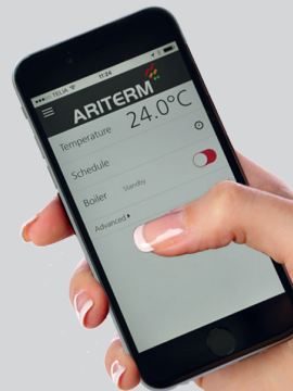
Ariterm Biotic+ 20i / 40i with WiFi/Internet connection allowing remote computer/smartphone control.