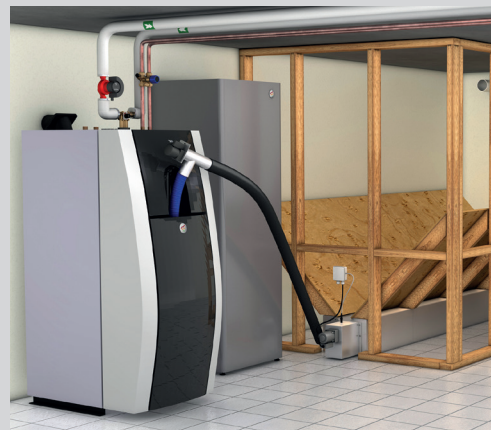
Ariterm Biotic+ 20i in combination with Ariterm Feedo feeding system and the Ariterm Depo.