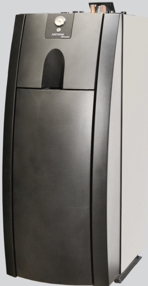
Ariterm Biotic+ 20i