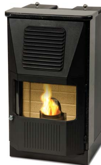
KMP MYSINGE Optionally equipped with black limestone top and sides.