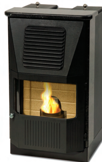
KMP MYSINGE Optionally equipped with black limestone top and sides.

As an option, the top and sides of the stove can be obtained in soapstone, rustic grey limestone or polished black limestone.