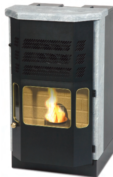
KMP SOLBERGA Optionally equipped with soapstone top and sides.